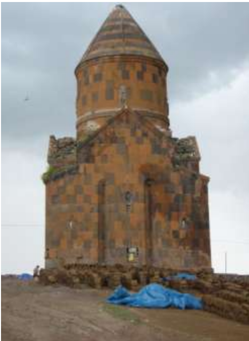
Garmeer Vank (Red Church) near Armenia border