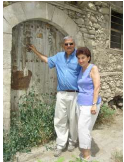
Armenian home in Veri Tagh, Kharpert