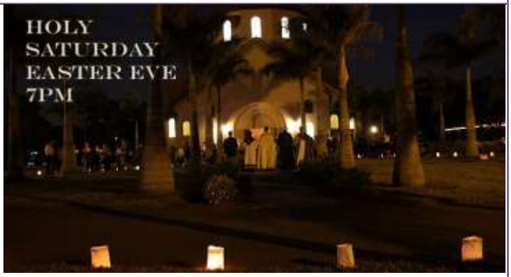
Easter Eve "Jragalooyts Badarak" Sat. Apr. 4 | 7 PM