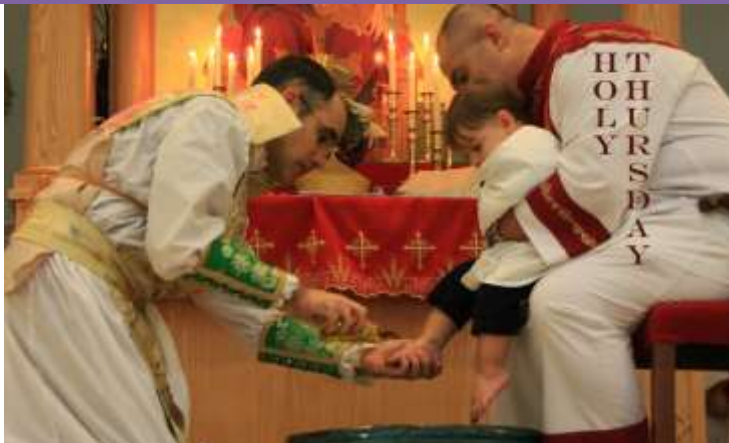
Washing of the Feet/"Votnlva" Thur. Apr. 2 | 7 PM

Join us for the most important and fulfilling worship services of the entire Armenian Church year.