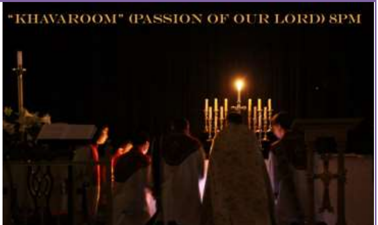
"Khavaroom" (Passion of our Lord) Thur. Apr. 2 | 8 PM