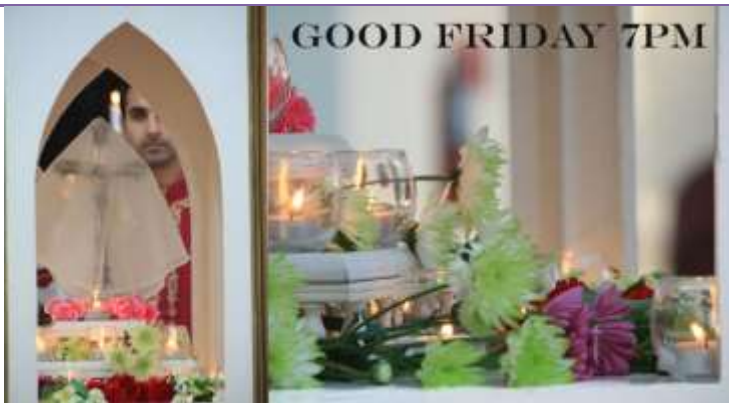
Good Friday Burial Service Fri. Apr. 3 | 7 PM