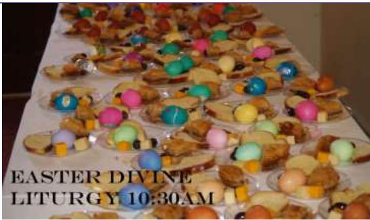
EASTER DIVINE LITURGY 10:30AM