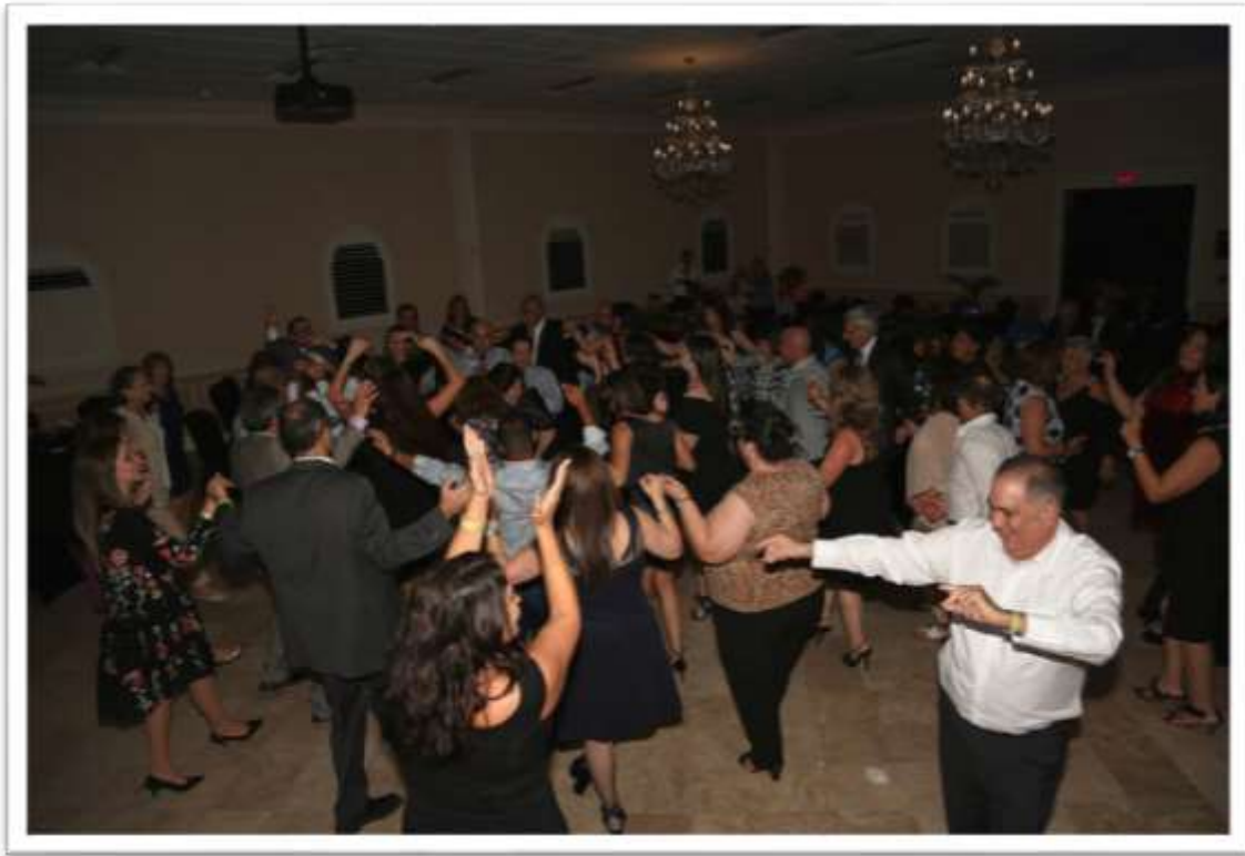
Photo 3-St. Hagop 10th Anniversary Dinner Dance Oct. 21