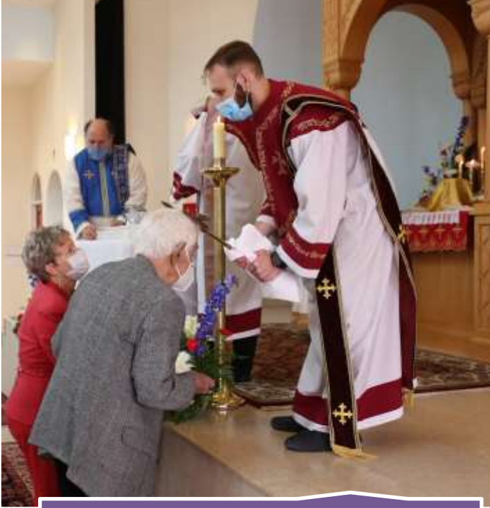
Armenian Christmas-Blessing of Waters