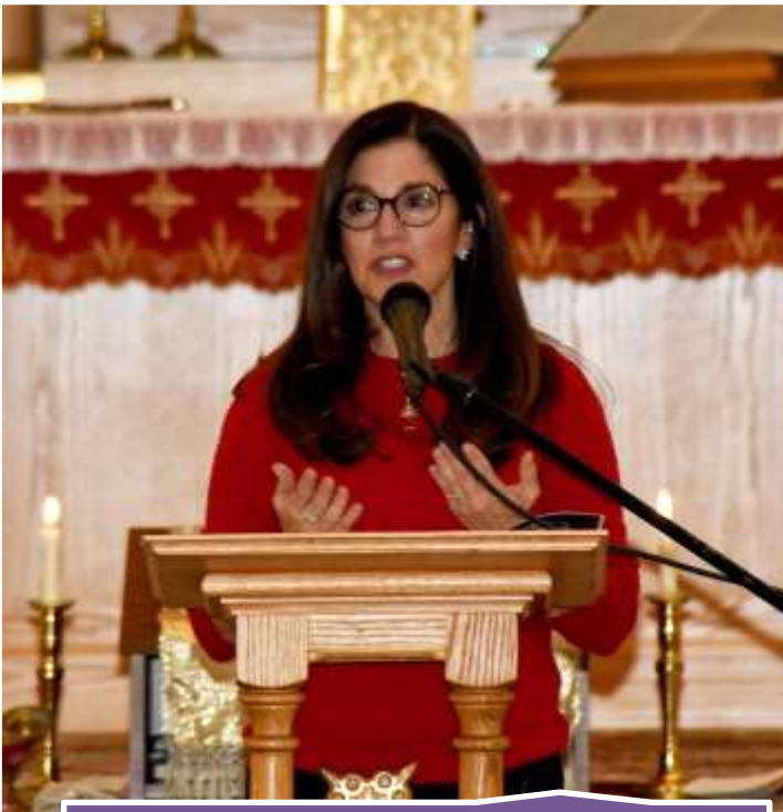
Advent Candlelight Dinner