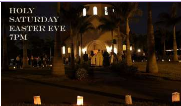
Easter Eve "Jragalooys Badarak" Sat. April 3 | 7 pm