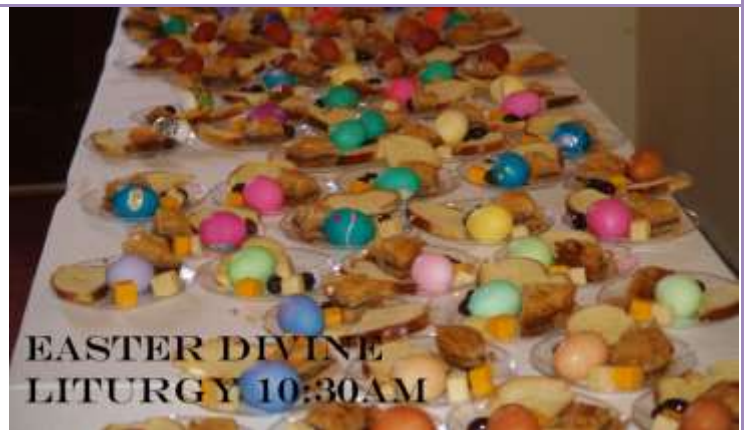
EASTER DIVINE LITURGY 10:30AM