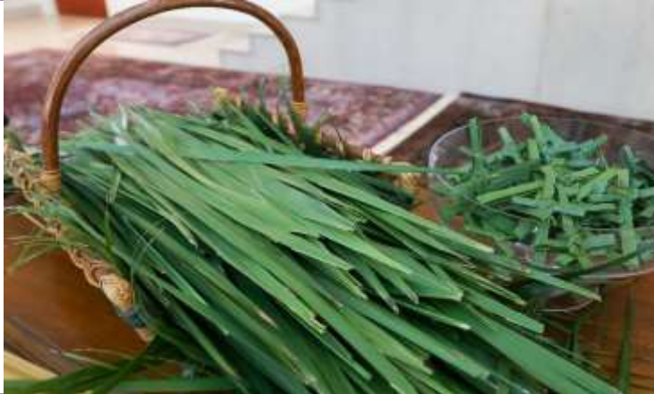
Palm Sunday Divine Liturgy Sun. March 28 | 10:30 am

Join us for the most important and fulfilling worship services of the entire Armenian Church year.