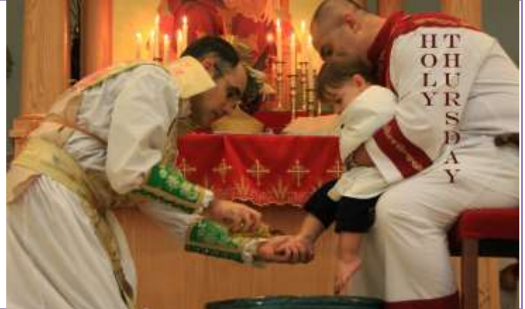
Washing of the Feet/"Votniva" Thur. April 1 | 7 pm