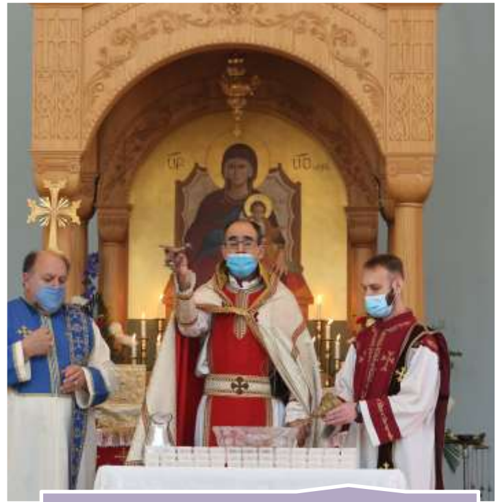
January 10, 2021