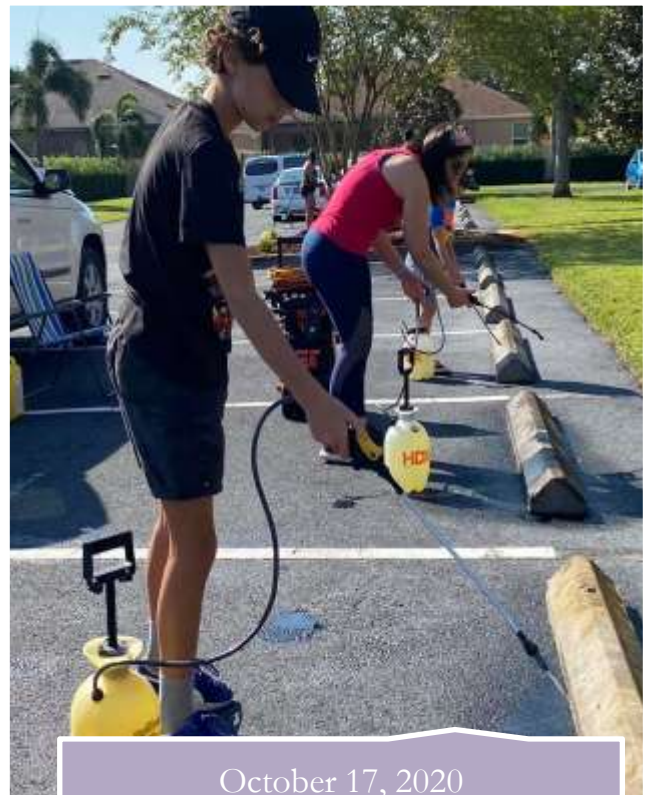
October 17, 2020