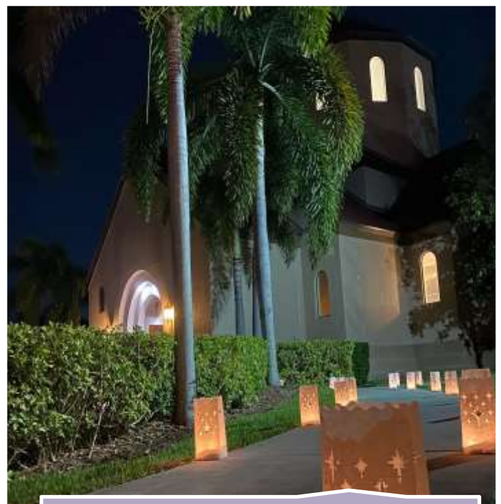
December 2, 2020