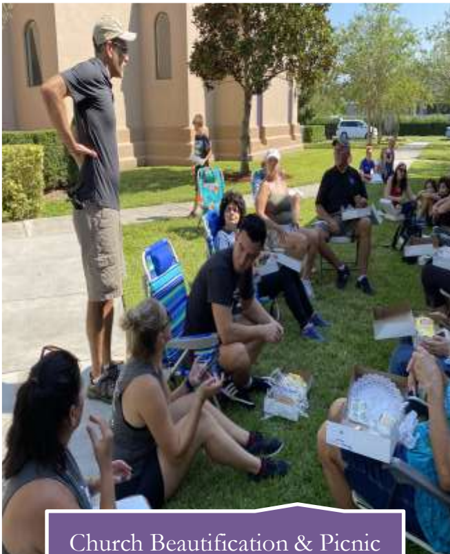
Church Beautification & Picnic