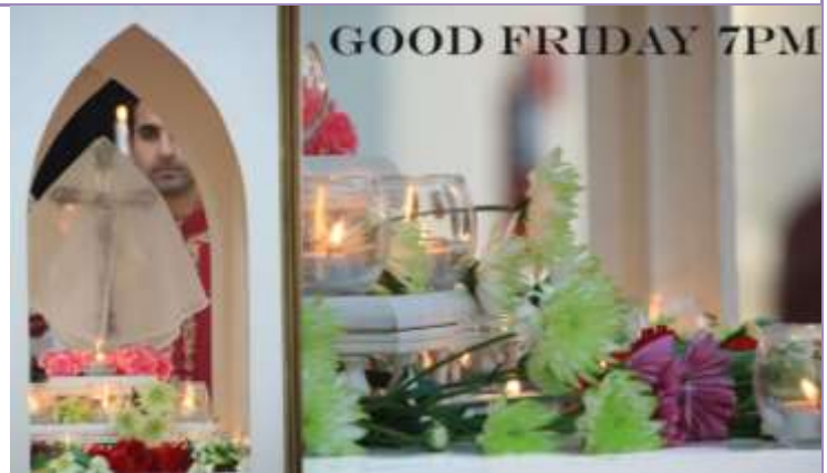
Good Friday Burial Service Fri. April 2 | 7 pm