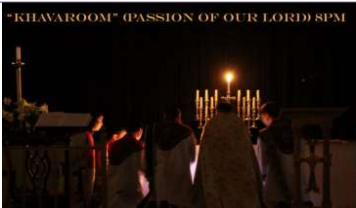
"Khavaroom" (Passion of our Lord) Thur. April 1 | 8 pm