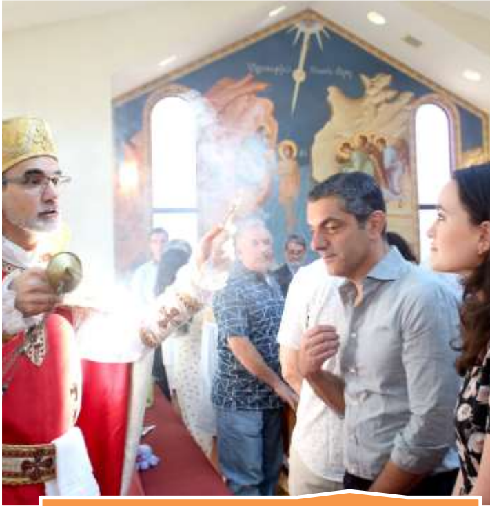
Easter Sunday Worship