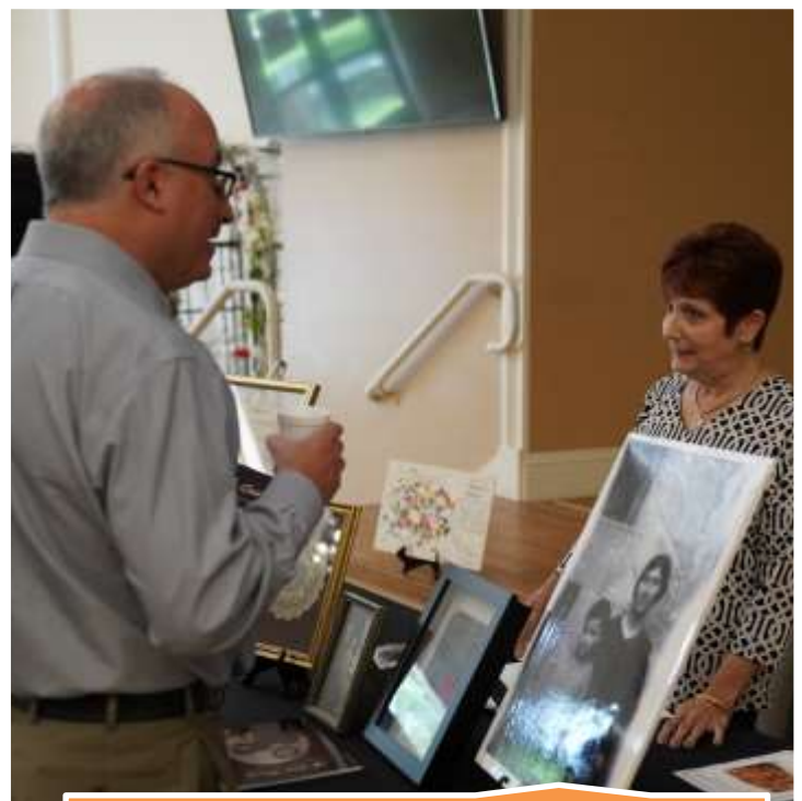
'Silent Genocide' Author Talk