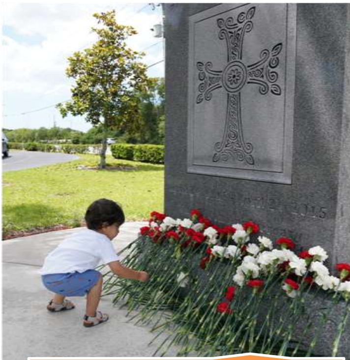
Genocide Martyrs Commemoration