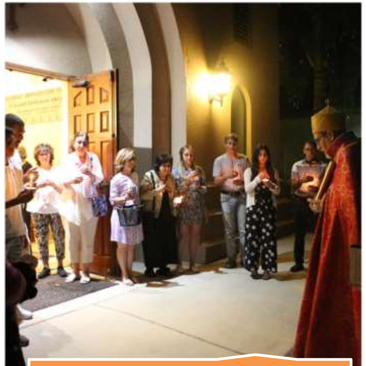
Easter Eve Candlelight Liturgy