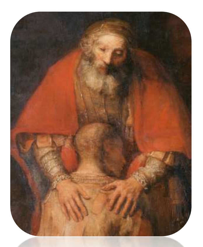
Today's Scripture Readings:

Isaiah 54:11-55:13 2 Corinthians 6:1-7:1 Luke 15:1-32